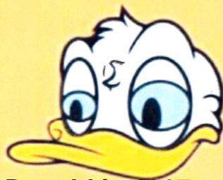
Donald in 1967