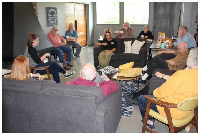
The private meeting room at Fairmount Coffee which is reserved for our Mensa group.

Our last two official meetings have been held at Fairmount Coffee. Though most of us are too old to enjoy much change, it is generally agreed that this location would be well suited to future gatherings.