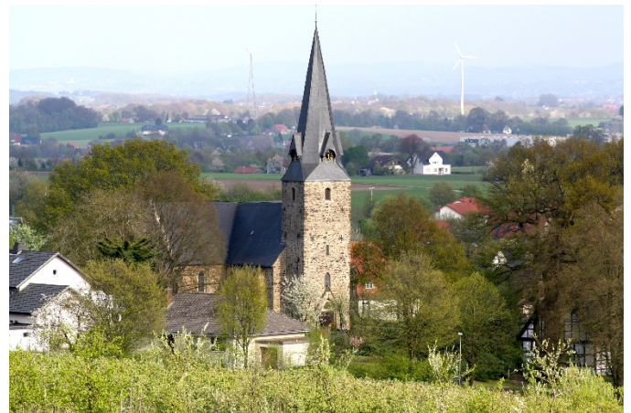
A peaceful scene in the German countryside. Nearly every town or village will have at least one church.

There is not anything good that comes from leaders who tolerate the rape culture. It is not a matter of political or religious views. There are people from the all political and religious views who do not tolerate the rape culture. Some people say these people are from God. They are not. They are chosen by us. The religious leaders who tolerate the rape culture and people who promote it do not speak for God. They speak for themselves.