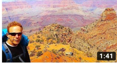
About My Channel The Wilderness Hiker