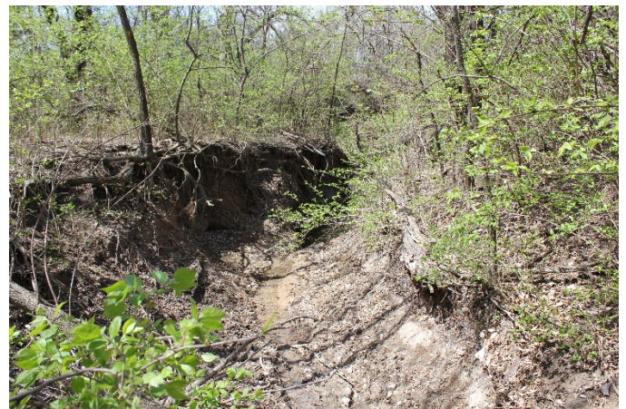
A fork of Chisolm Creek which was dry this spring but is overflowing its banks as this is being written. Located in East Wichita.

The cat promptly replied that she thought life was superb. She stated that, "I have never been happier. That pillow and those meals on wheels you sent me are wonderful!"