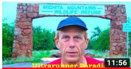
Ultrarunner Paradise Running The Wichitas Part 1