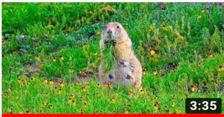
Prarie Dog Town Wichita Mountain Wildlife Refuge