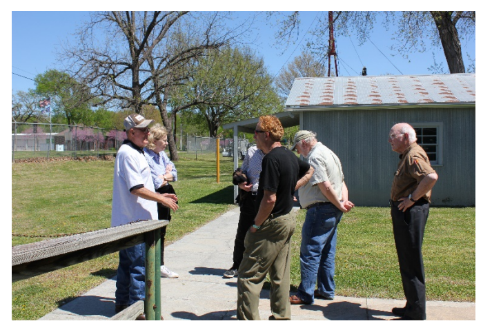
Figure 2: Some members hearing oil well stories from a volunteer at the museum. He even fired up both a rotary and old fashion impact drilling rig for our edification and entertainment.