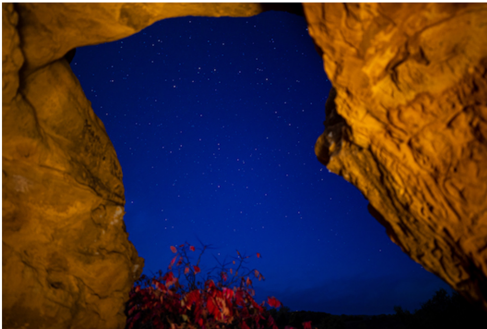
Looking Out Dragon Cave At Night

Its not possible for a photographer to be good at everything. Some photography subjects are full of too many people. I was told that in Wichita you cant's swing a dead cat without hitting a photographer. Everyone wants to do weddings and personal portraits. And they want to do it the easy way, just shoot it. I know a portrait photographer. One session is $$$$$. But that includes the portrait consultation, the location consultation, the outfit consultation, the hair consultation, the makeup consultation, the onsite person for hair and makeup, the lighting as well as the photographer. There is a lot of work and planning in it. This photographer can make anyone look Hollywood gorgeous in the photos and there is a big portfolio provided, not just a photo. If someone wants to stand out and be noticed then he needs to do something different from the herd. Leave the herd, don't be a paparazzi, be the one on a new frontier doing something no one else can or will do.