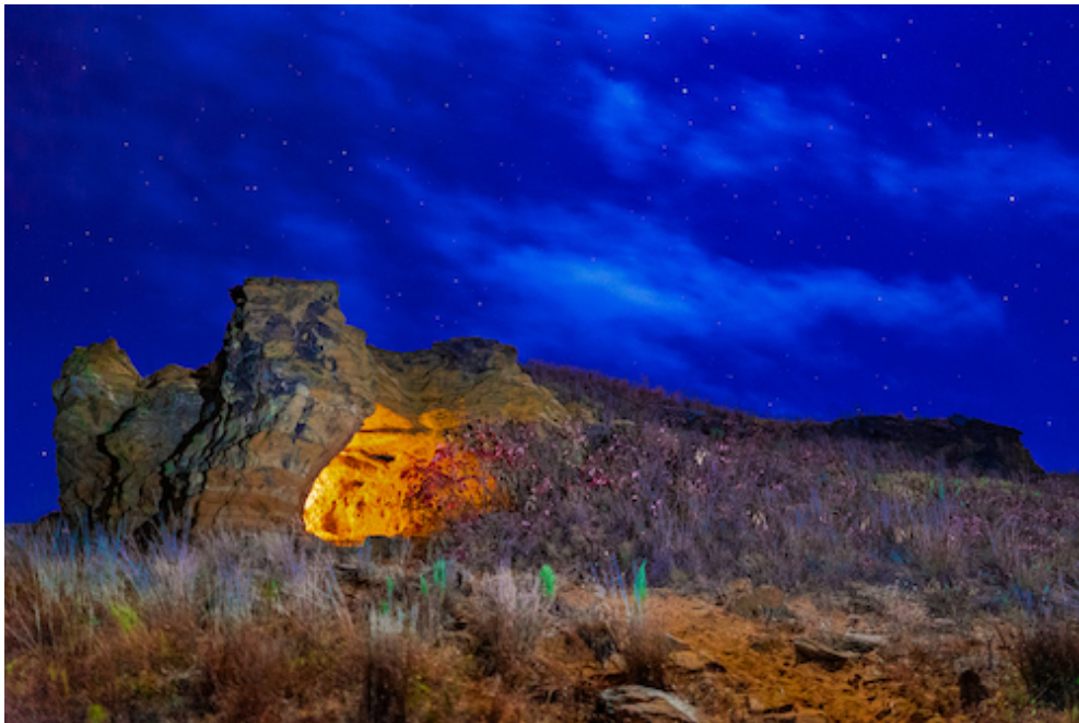
Dragon Cave At Night

Since that time I lost the ability of putting an artistic image on canvas or even paper, but I never lost the ideas in my mind. Always I think of what to paint and how it should look, but only in my mind. I imagine it, but can't put it on a canvas. Just like I imagine redesigning almost everything I see.