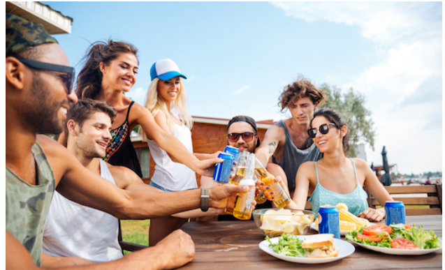
Pig-Outs are the perfect place to invite friends.

Vora Restaurant European 3252 E. Douglas Ave., Wichita (316) 977-9277